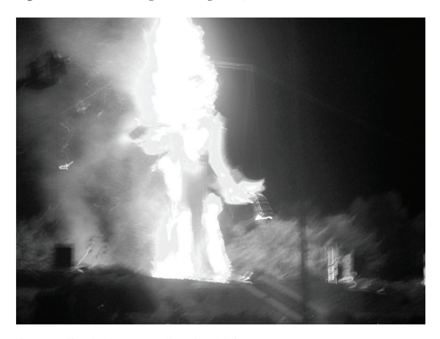
Figure 2. Zozobra burns 2011, Douglas H. Johnson