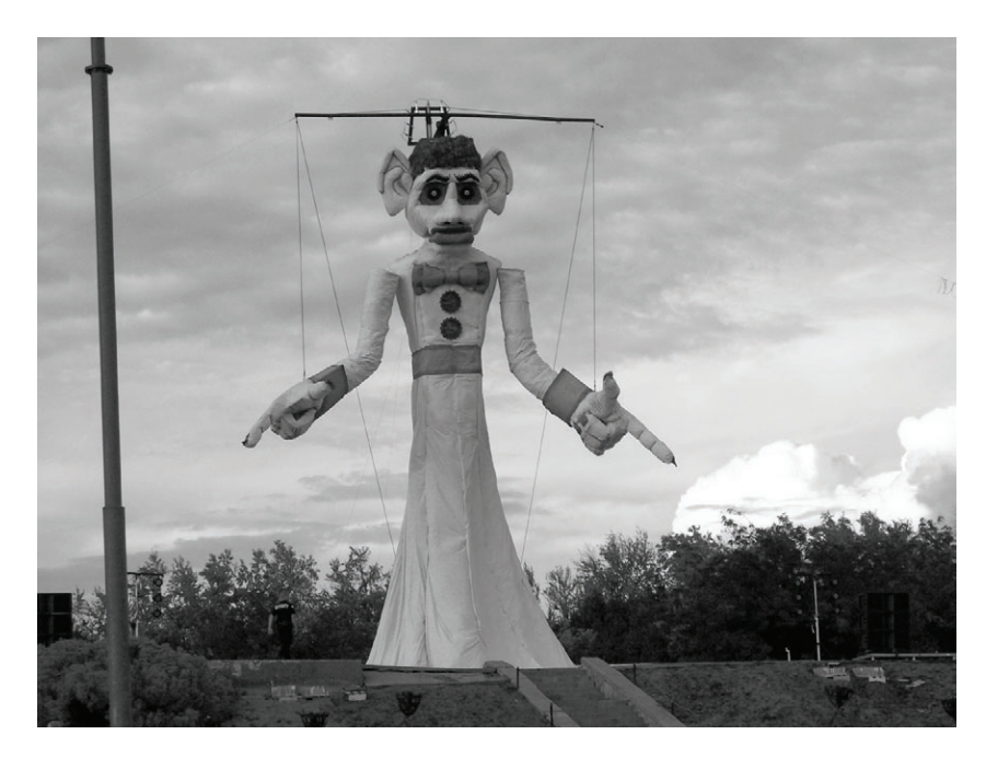
Figure 1. Zozobra limbering 2011, Douglas H. Johnson