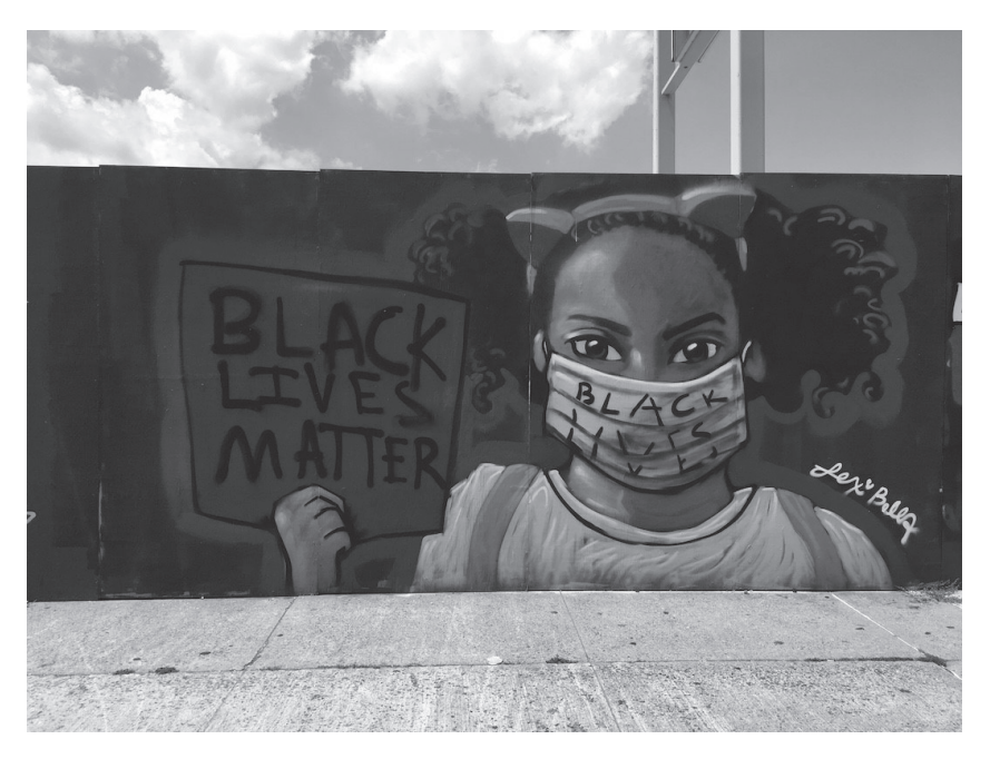
Figure 13: Street art in Gowanus, Brooklyn, of Black Lives Matter protestor wearing a Covid mask.

without much controversy. In the beginning, enforcement provoked criticism for disproportionately targeting minorities, especially black people. Then during the summer as the Black Lives Matter protests grew in scale and intensity, new challenges to the implementation of social distancing and mask wearing rules would arise (see Figure 13).