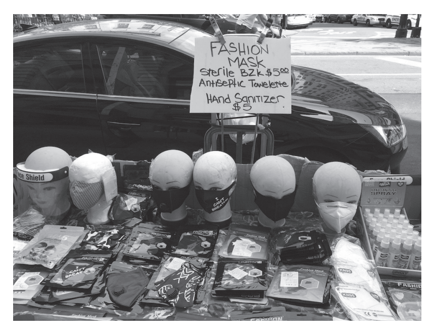
Figure 9: Street vendor's stand at Borough Hall, downtown Brooklyn, selling Black Lives Matter-themed masks.

fashion label Off-White's EUR 80 arrow face mask was the world's hottest men's fashion product in the first quarter of 2020, according to the fashion industry's Lyst Index.<sup>14</sup> In August, Burberry became the first luxury brand to launch an entire mask "collection" available in the company's signature plaid pattern for USD 120. Face masks today pretty much mirror any typical accessory category: products range from the USD 1 bargain version to extravagant, unique creations, like the diamond-studded face mask that was commissioned by a US-based Chinese businessman from an Israeli jeweler for USD 1.5 million, or French designer Anne-Sophie Cochevelou's custom-made pieces adorned with Barbie heads and Pokémon toys. The French designer's stance is that