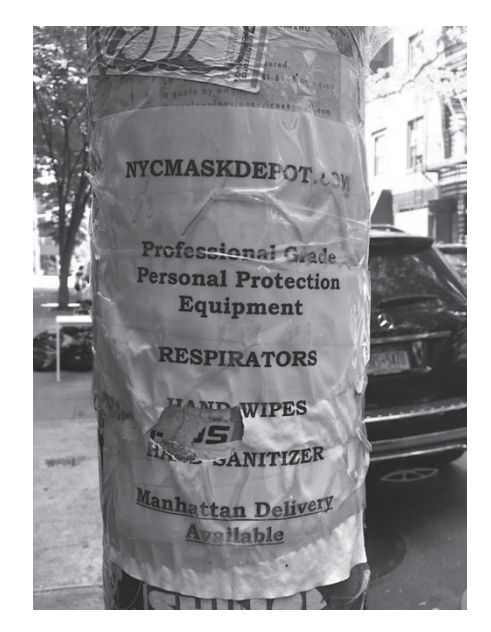
Figure 4: Flyer on a lamppost advertising professional grade PPE, Greenwich Village, New York.

New York state administrators to enter into quick deals and pay upfront for PPE that was, in the end, never delivered, defective, substandard, or no longer needed. At the end of 2020, New York state was trying to recover, or get at least partial refunds on, one-third of the USD 1.1 billion it spent on emergency medical supplies and equipment during the spring.