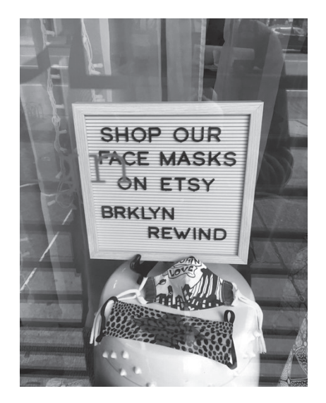
Figure 6: Local fashion boutique on Atlantic Avenue, Brooklyn, selling its masks on Etsy.