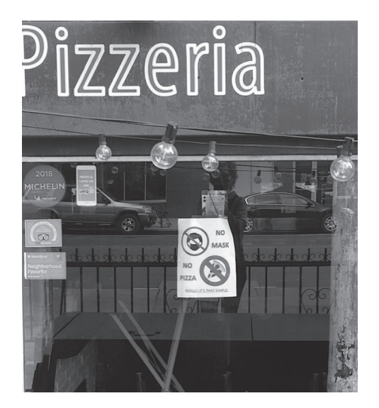
Figure 14: "No mask, no pizza" sign at a pizzeria in Brooklyn.

Pandemic Exposures: Economy and Society in the Time of Coronavirus