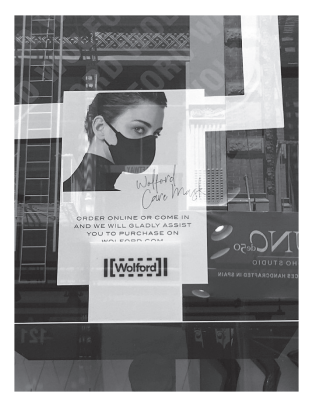
Figure 10: Luxury lingerie brand selling a "care mask" in its flagship SoHo store.

disposable surgical masks can make people anxious. She aims, therefore, to inspire everyone to get creative and playful with their masks, suggesting how turning face masks into relatable fashion items may actually offer a kind of everyday coping strategy with the pandemic.