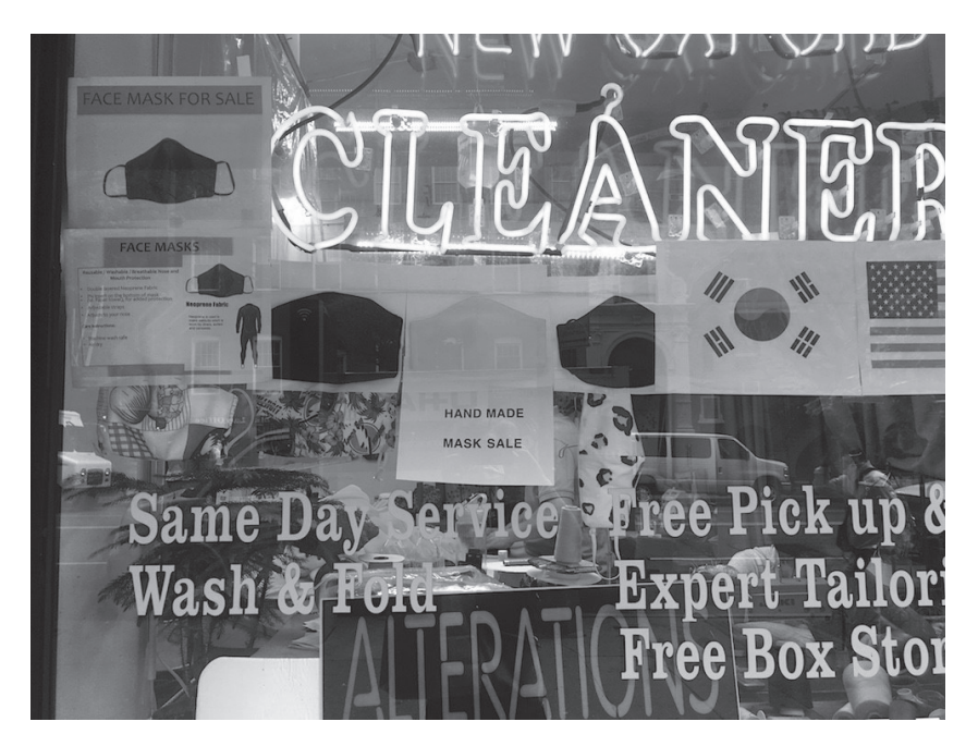
Figure 8: Cleaner in the West Village selling face masks, New York.

Face masks, however, have swiftly grown into a lucrative business option even for mainstream brands (see Figure 10), with some analysts beginning to raise fears about a potential market bubble. The Italian luxury