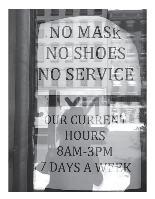
Figure 15: Sign on entrance door to a coffee shop in SoHo requesting patrons to wear masks. (Source: Photograph by Virág Molnár.)

Figure 14: "No mask, no pizza" sign at a pizzeria in Brooklyn. (Source: Photograph by Virág Molnár.)