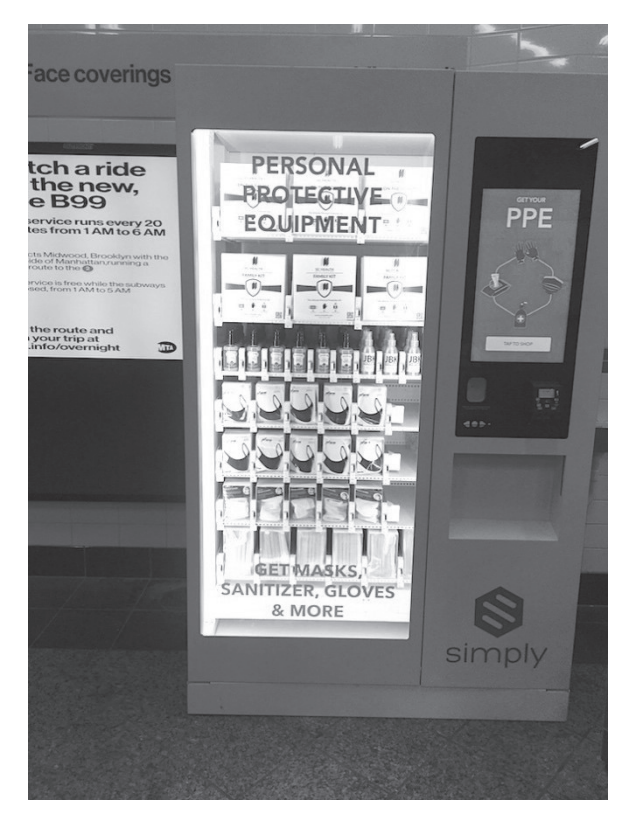
Figure 11: PPE vending machine at the Barclays Center subway stop, Brooklyn.

MaskClub.com offers a monthly subscription service with licensed designs from Sesame Street, Sanrio, and Nickelodeon. Ads for face masks now follow us everywhere in our online searches. According to some forecasts, by 2021 the US market for face masks could amount to USD 6 billion. On Etsy, masks are now the top-selling product and, as of the second quarter of 2020, about 29 million face masks were sold through the site (Bluestein 2020). And cities like New York have installed facemask vending machines in busy subway stops (see Figure 11).