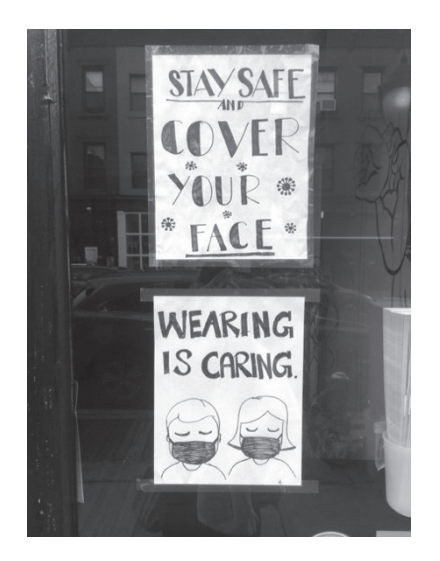
Figure 5: Signs asking for mask wearing on entrance door of Thai restaurant in Cobble Hill, Brooklyn.

to wear — catapulted face masks into one of the hottest wardrobe musthaves of the season.