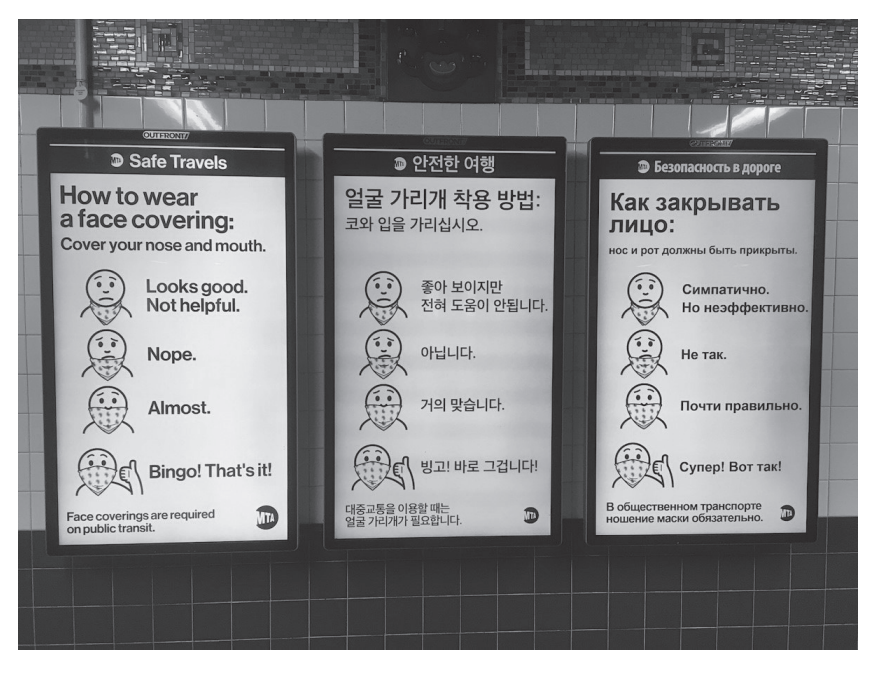
Figure 12: Public service announcement of the obligation to wear a mask at the Canal Street subway station in New York City.

President Trump, who could have offered clear guidance on masks to the country, instead became a model of inconsistency and evasion. When the CDC changed its position on masks and began recommending them, he reluctantly took notice but also immediately distanced himself, noting that "wearing a face mask as I greet presidents, prime ministers, dictators, kings, queens — I don't know … somehow I don't see it for myself." The New York Times published detailed infographics that tracked Trump's zigzagging positions with respect to masks, which helped to turn masks into a flashpoint in the culture wars and a symbol of government overreach (Manjoo 2020b). As a result of these developments, "masks have become this politicized symbol, a way to signal ingroup identity. Instead of debating the health or the science, for some, it's become a debate over individual rights … people who resist masks the most cite personal freedom as their reason," said host Mary Childs on Planet Money on August 7, 2020.