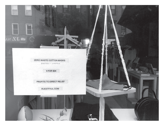
Figure 7: Local fashion boutique donating income from masks to charity, Cobble Hill, Brooklyn. (Source: Photograph by Virág Molnár.)

Figure 6: Local fashion boutique on Atlantic Avenue, Brooklyn, selling its masks on Etsy. (Source: Photograph by Virág Molnár.)