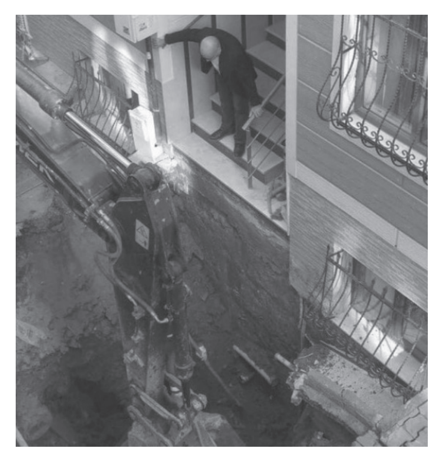
Figure 2: Image of an elderly man who wishes to go out but cannot because an excavator is digging a hole right in front of his apartment building.

elderly a ride back home. To limit elderly people from being outdoors, municipalities would remove seating from public parks. In what seems like a cruel joke (see Figure 2), the Uskudar municipality of Istanbul comments on how it uses other tactics to ensure that the elderly remain indoors: "We love you, but please do not push us to do this" (Belediyesi 2020).